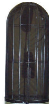
CEL-6736 replacement wind sock and fixing strap